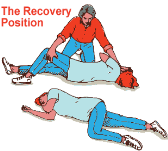
The Recovery Position

START BASIC LIFE SUPPORT AS SOON AS POSSIBLE